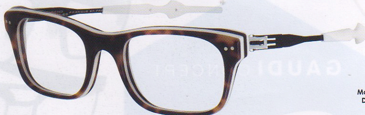
Left to right: Model Aither by Moko Besicles from Moko France; DILEM XD interchangeable temples, designed for teenagers to customise their look